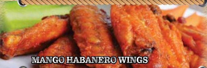
MANGO HABANERO WINGS