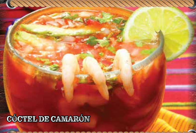
CÓCTEL DE CAMARÓN

Shrimp marinated in lime juice mixed with finely chopped onions, cilantro, jalapeños and tomatoes. Served with avocados - 16.00