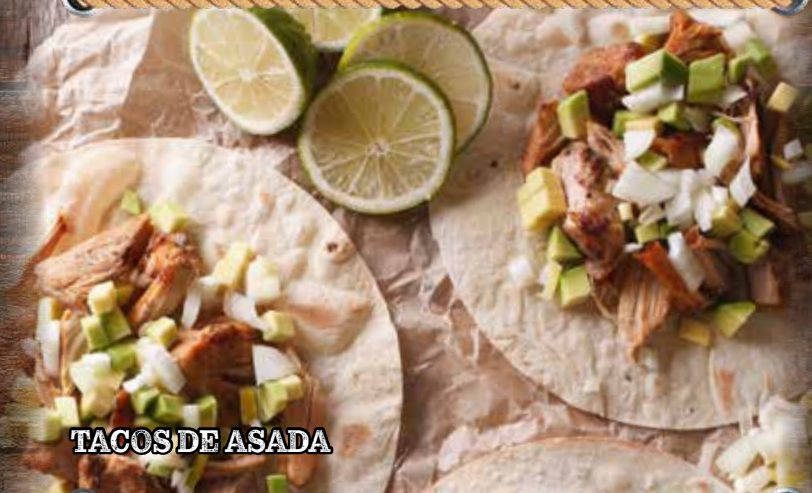
TACOS DE ASADA

Four folded soft corn tortillas filled with one steak, one al pastor, one carnitas and one chorizo with onion and cilantro, served with delicious tomatillo sauce on the side. Rice and beans not served with street tacos - 16.00