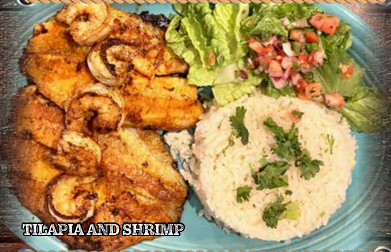
TILAPIA AND SHRIMP